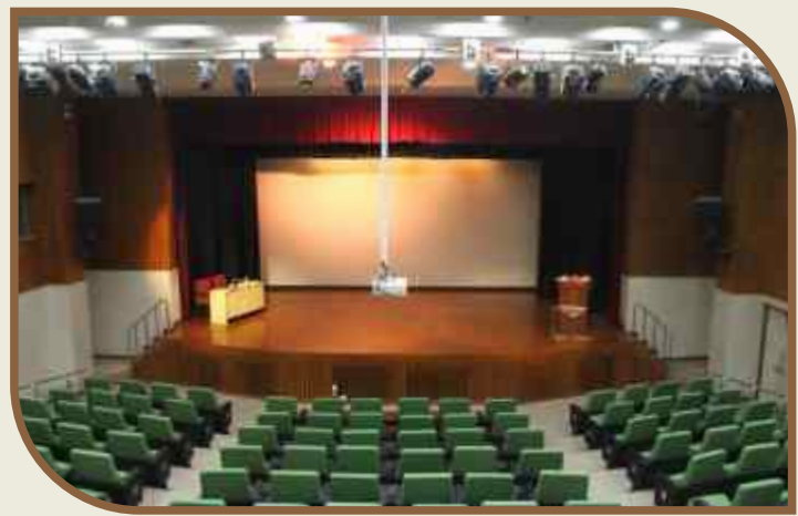
12 VIDESH SEWA | SONTERED HALL