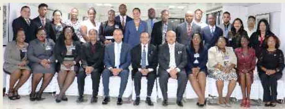
Suriname) participated in the Course. The Course was inaugurated by Dean (FSI) on 12 August while the valedictory