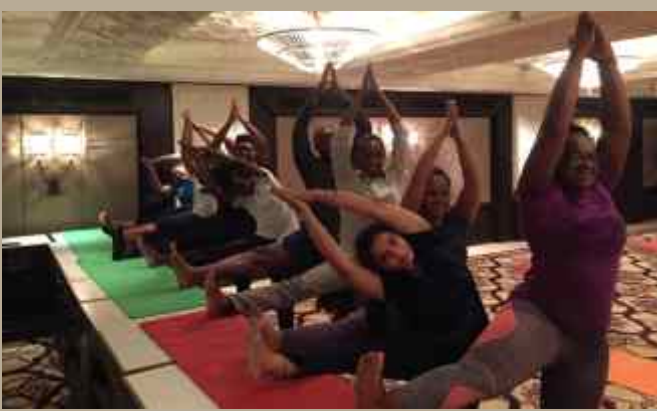
Diplomats from CARICOM countries participated in Yoga Session