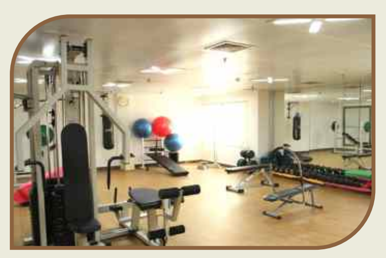
Health Club VIDESH SEWA | JUL-SEP 2019 13