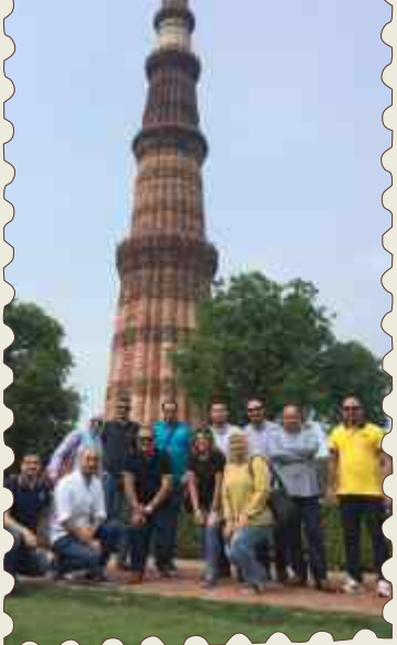
Visit to Qutub Minar by Iraqi diplomats