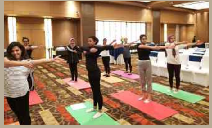
Diplomats from Libya and Palestine participated in Yoga Session